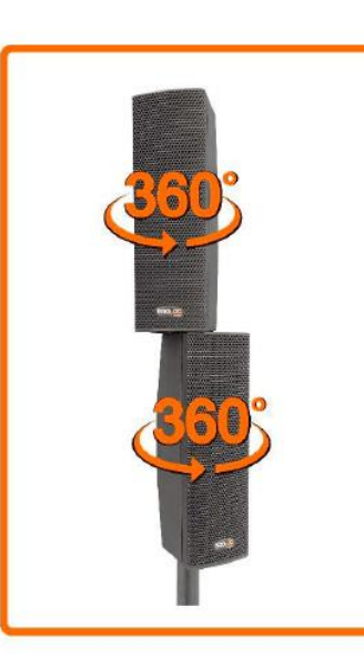
Allows full rotation (360°) of each i 427 A unit for full coverage.

Connector cylinder -Allows the connection between units i 427 A .